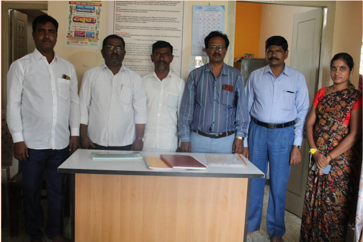
AID Board Members