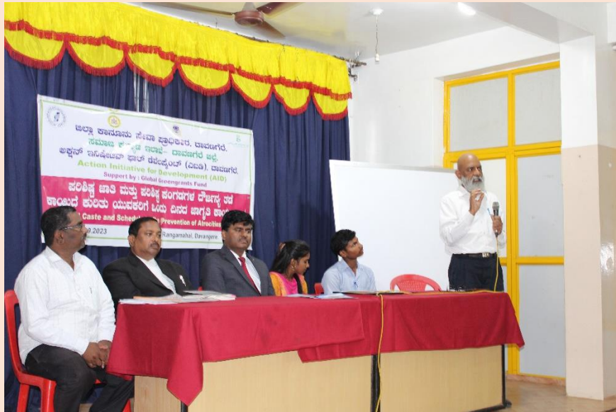
Legal Awareness Programme for Youth and Community Members